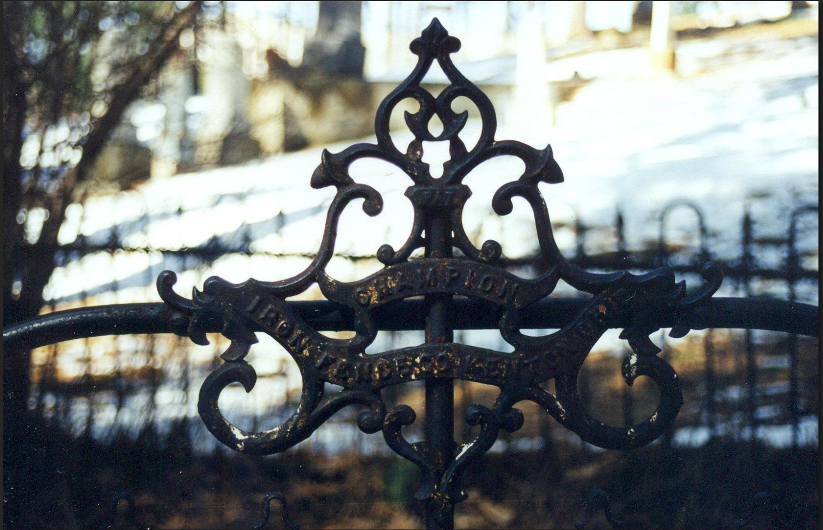
Champion Iron Gate made in Kenton Ohio – on Boot Hill Deadwood SD