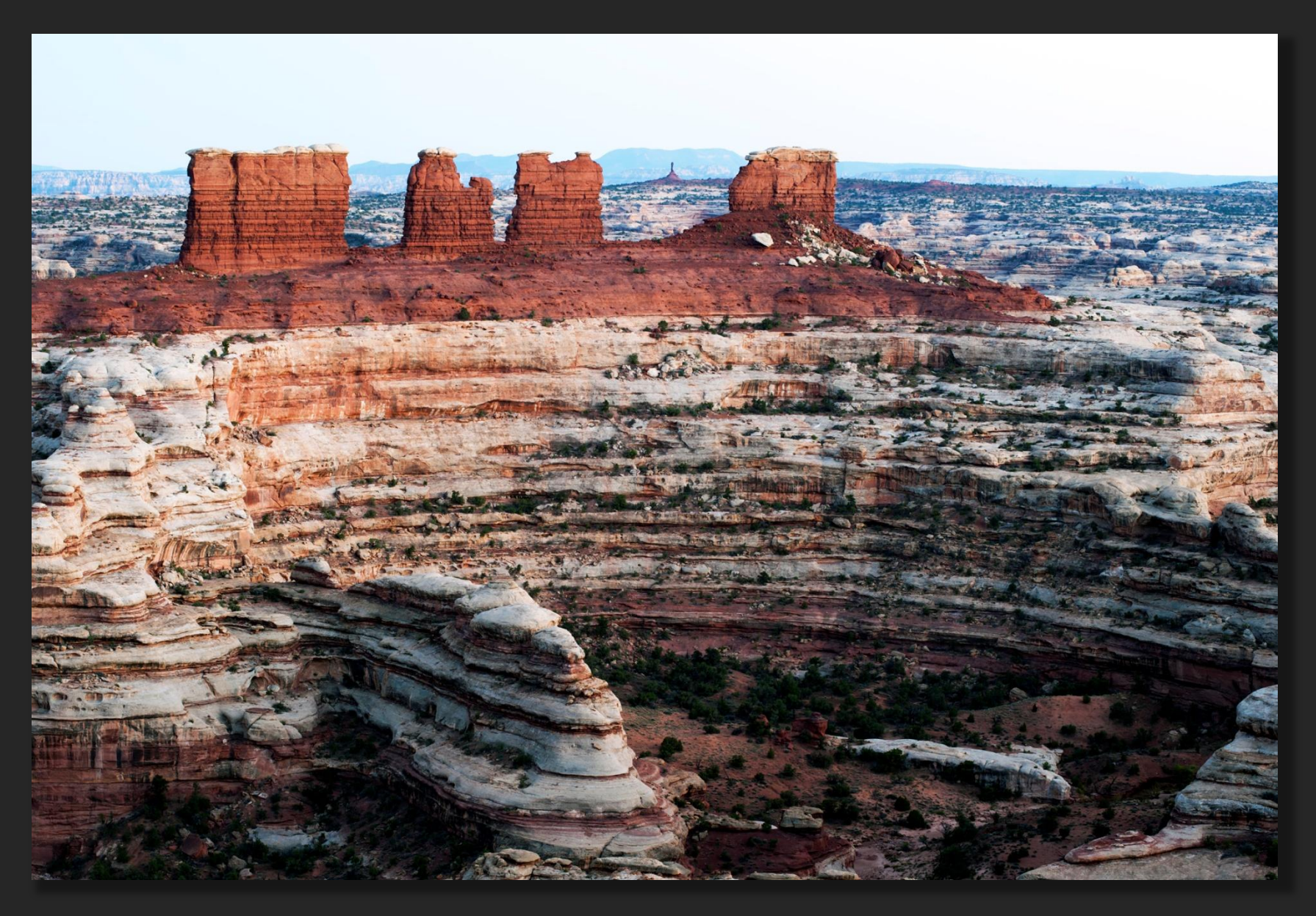
The Chocolate Drops - Canyonlands National Park - Maze District