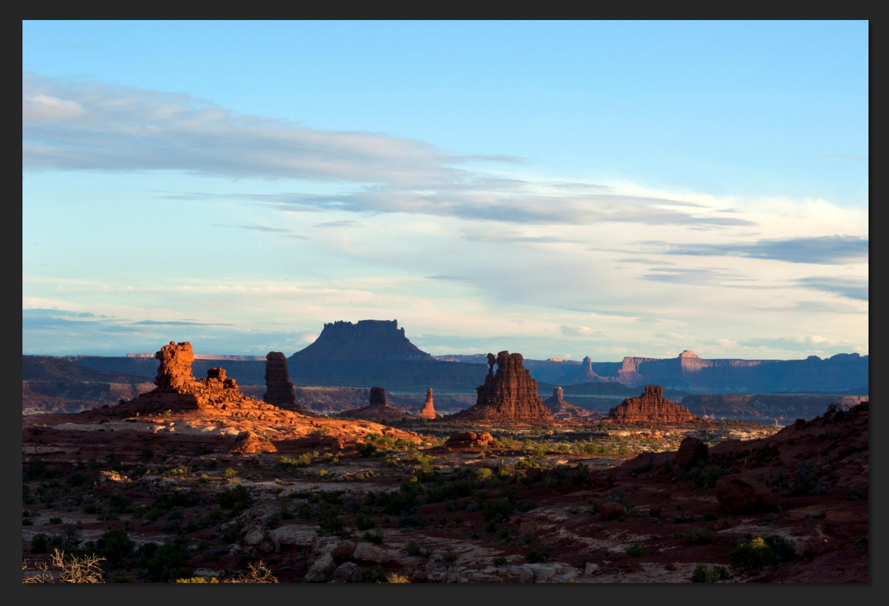
The Land of Standing Rocks - Canyonlands National Park - Maze District