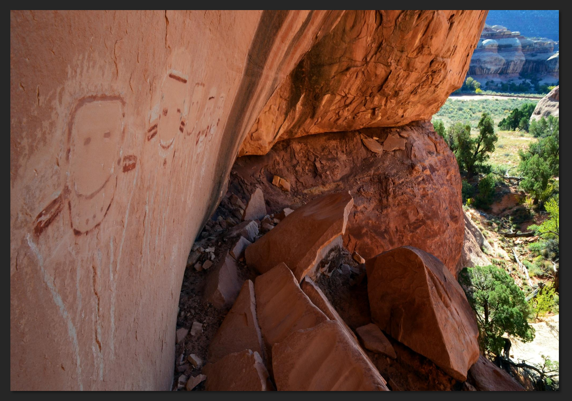
The Five Faces - Canyonlands National Park - Needles District