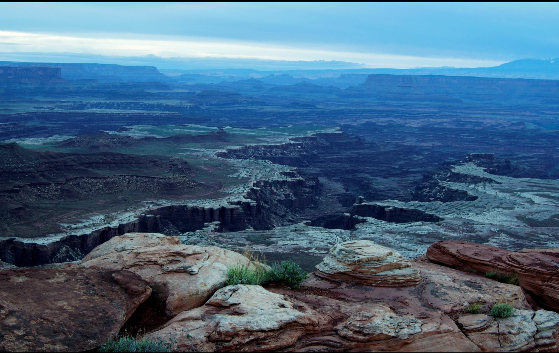
The Green River Overlook - Canyonlands National Park – Island in the Sky