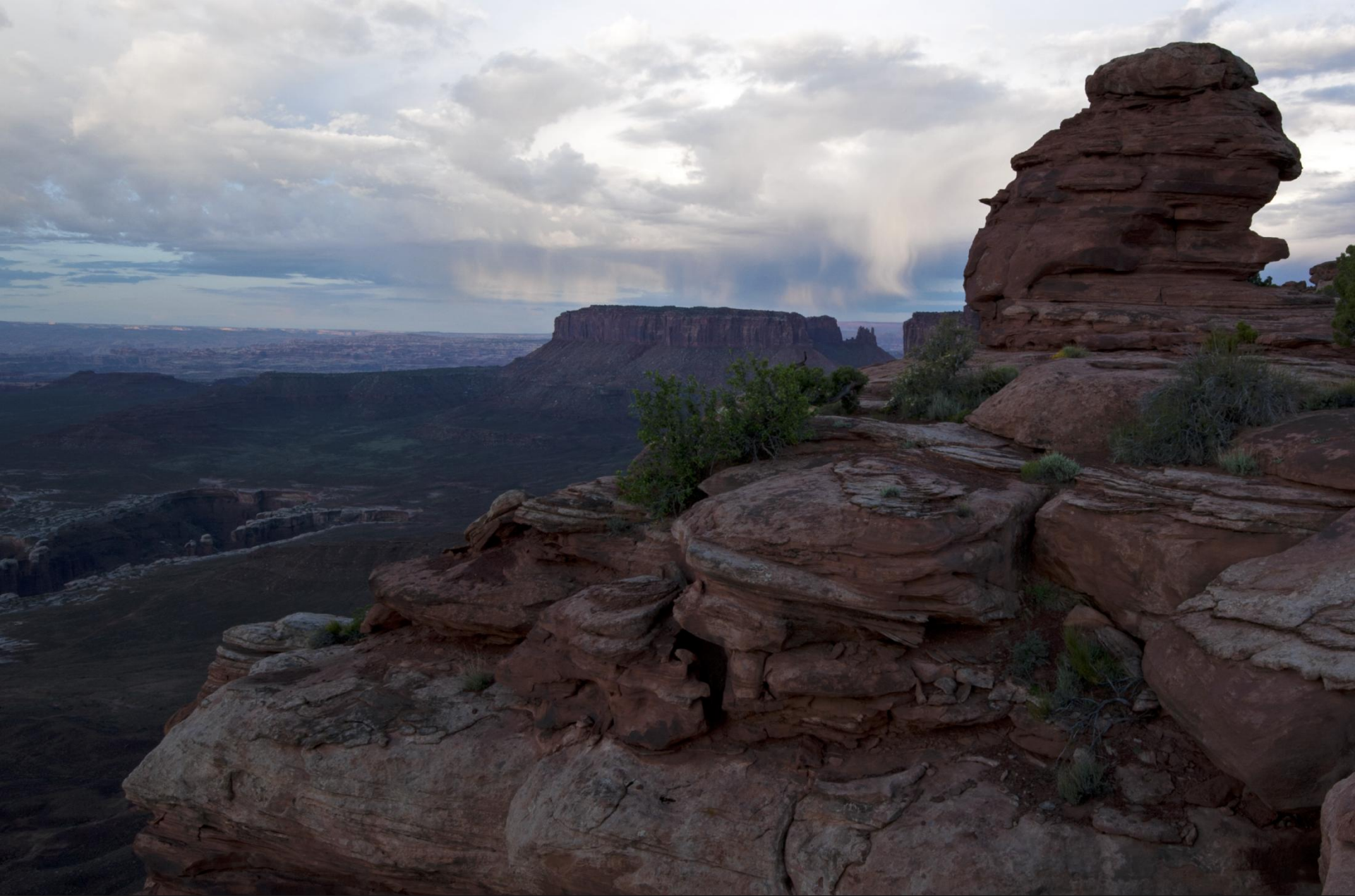
Canyonlands National Park – Island in the Sky