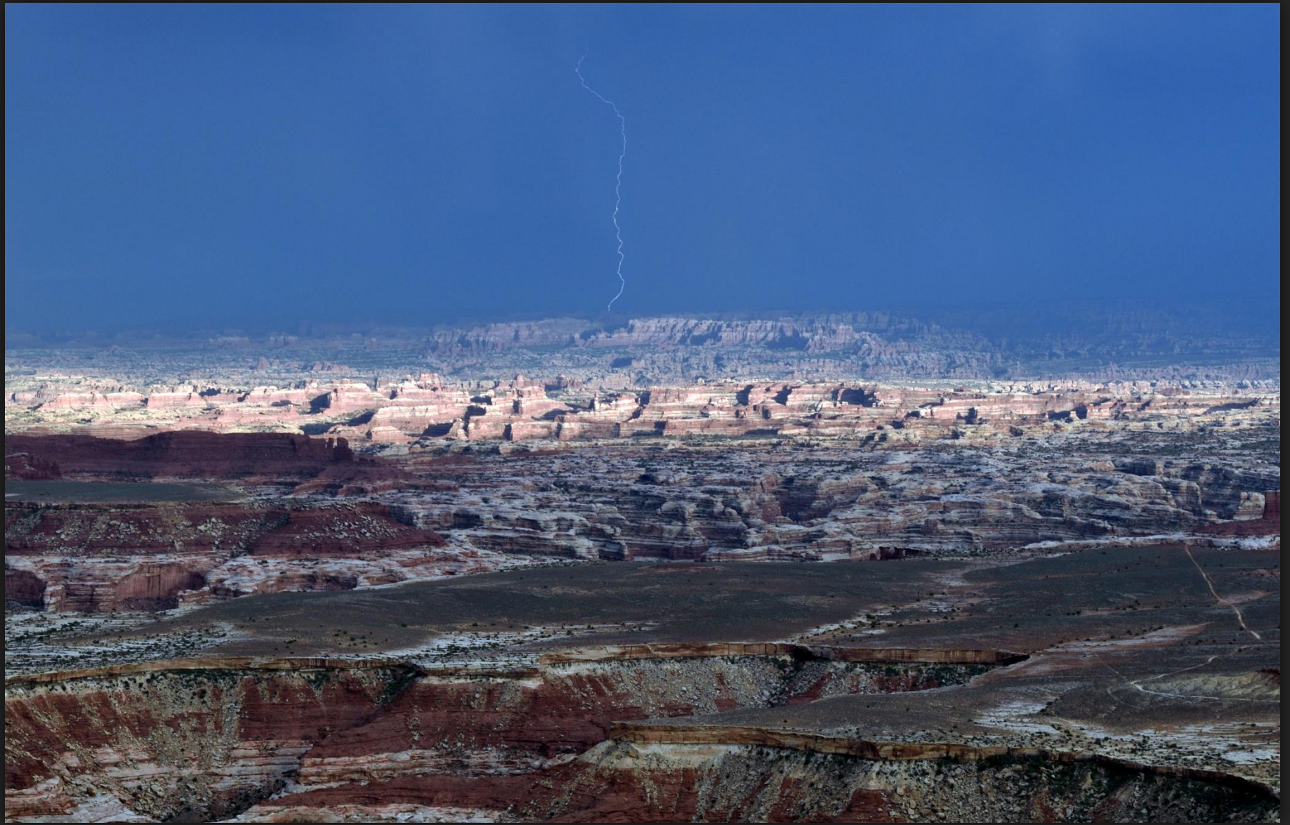
PANORAMA POINT – LIGHTNING IN THE NEEDLES