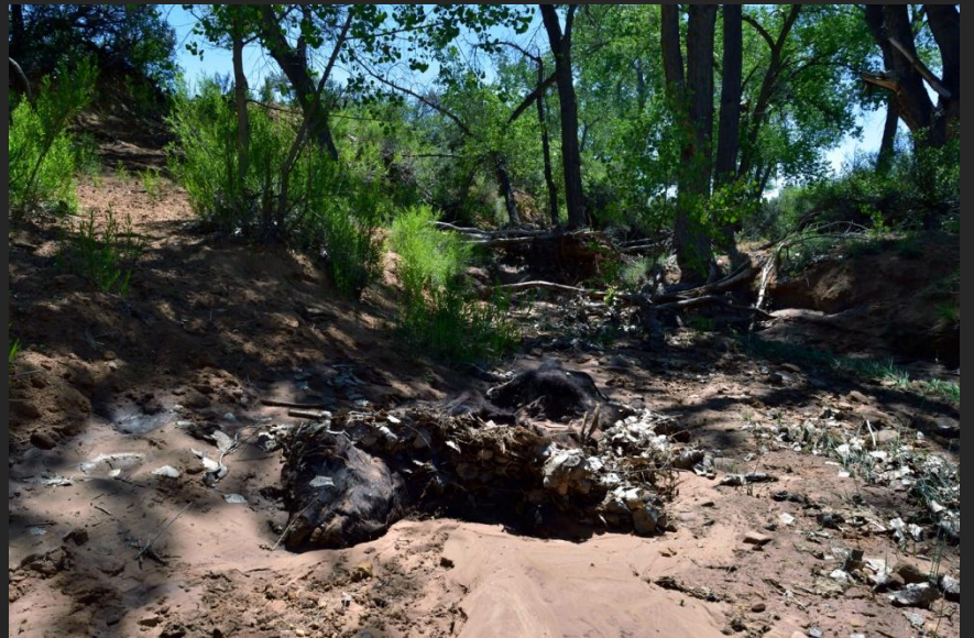
DEAD COW POINT