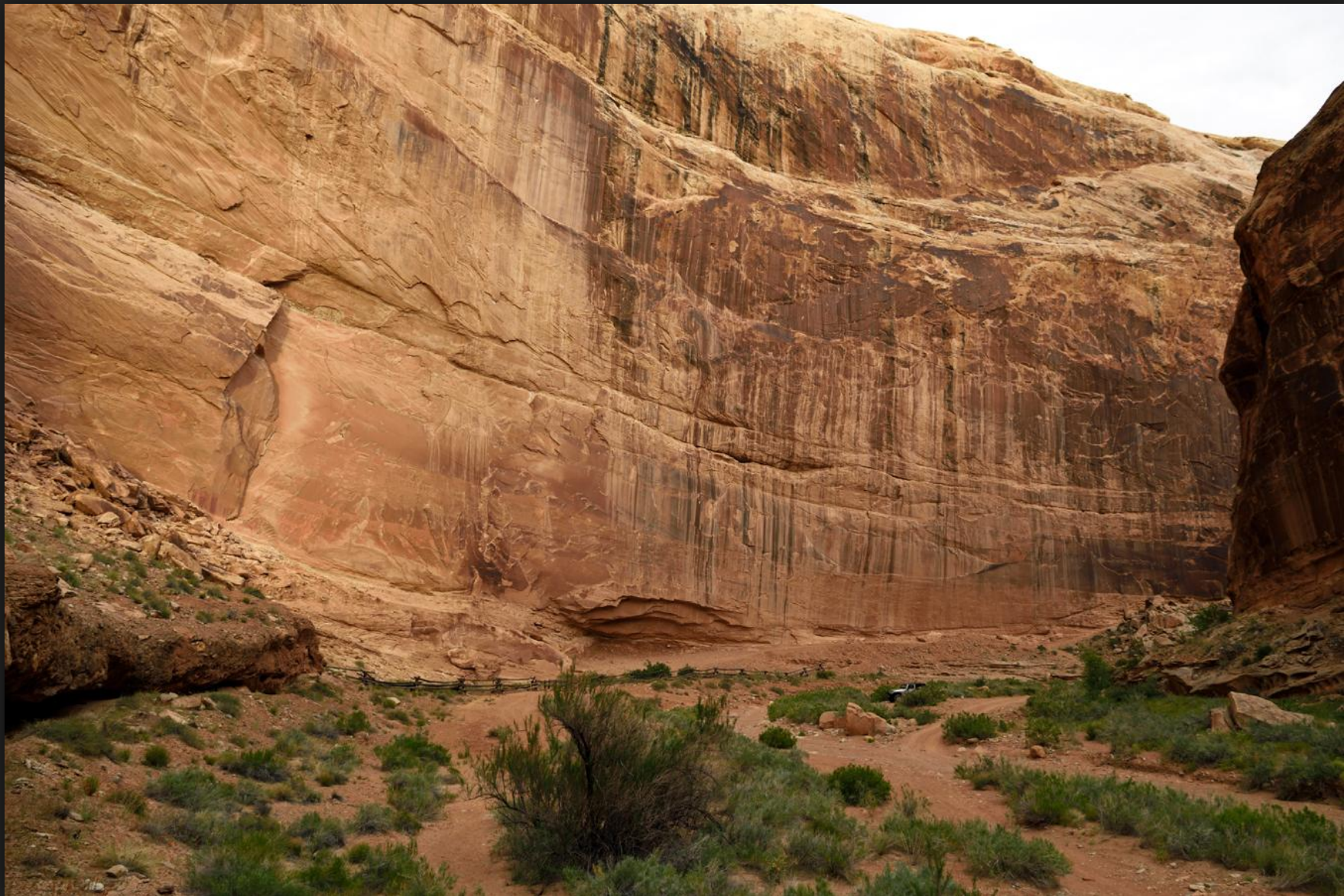
BLACK DRAGON CANYON