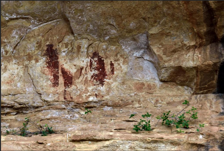
ANCIENT ART ABOVE THE CAVE