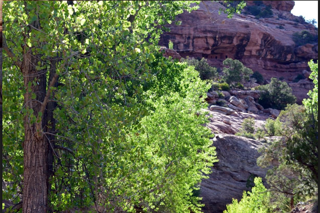
FIRST SIGHT OF RUIN FROM CANYON FLOOR