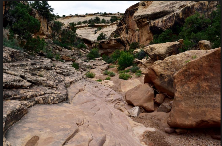
INSIDE THE CANYON