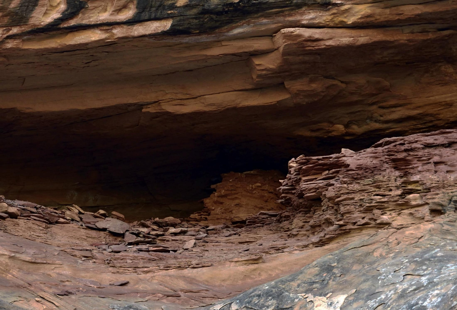
HAND-PRINTS INSIDE RUIN – DAVIS CANYON