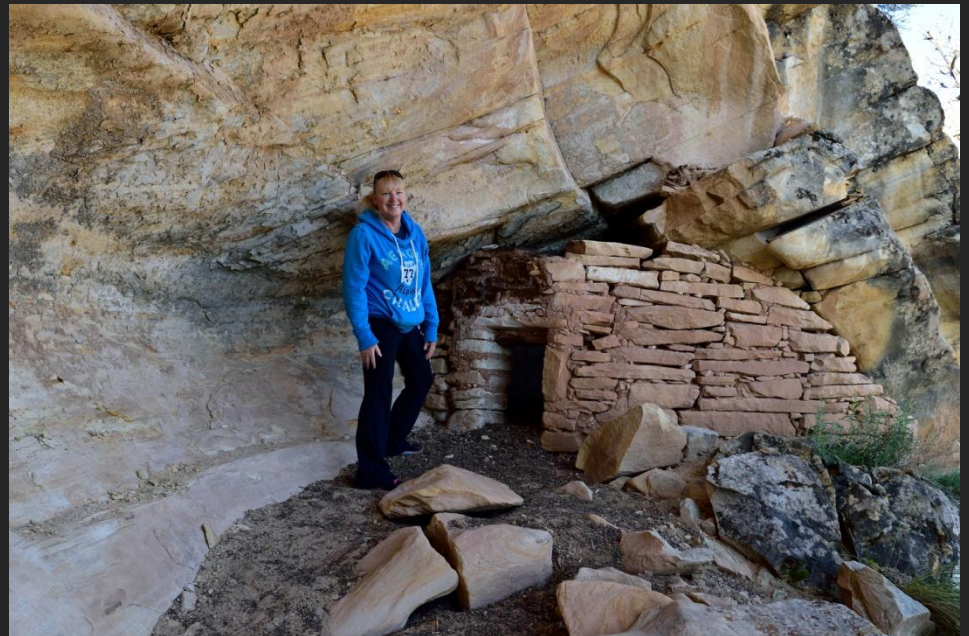
A SMALL RUIN ON THE BUTLER WASH NORTH OF HIGHWAY 95