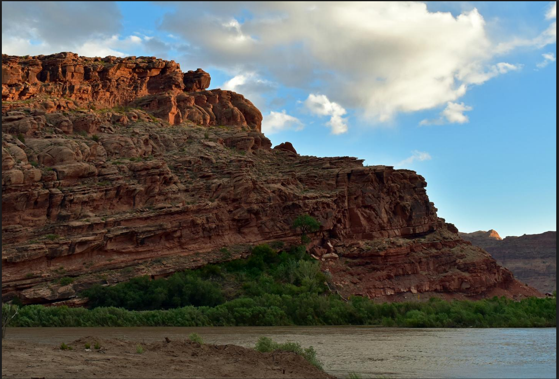
COLORADO RIVER IN MOAB – crazy man that guards the bridge says that the mark on that top rock is a map