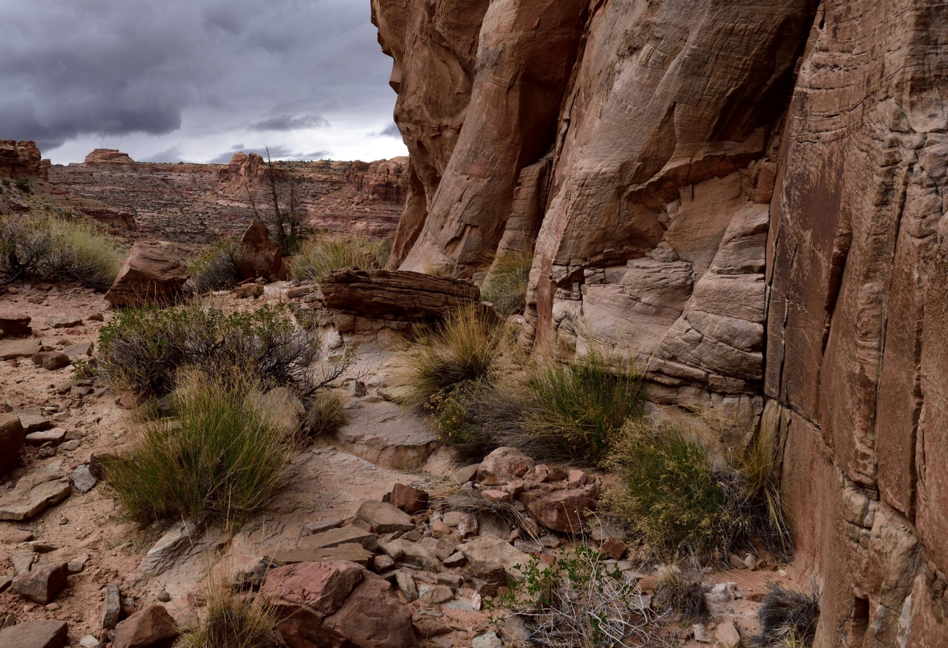
HIKING ON THE KANE CREEK LEDGE