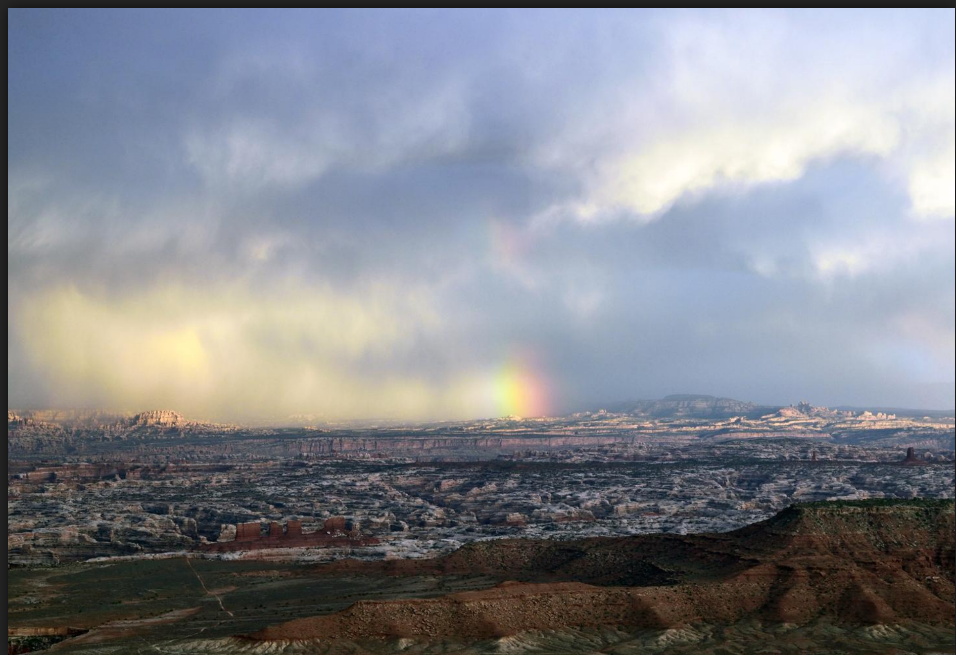
STORM IN THE CANYON – CHOCOLATE DROPS LOWER LEFT – STANDING ROCKS LOWER RIGHT – 5/8 18:57