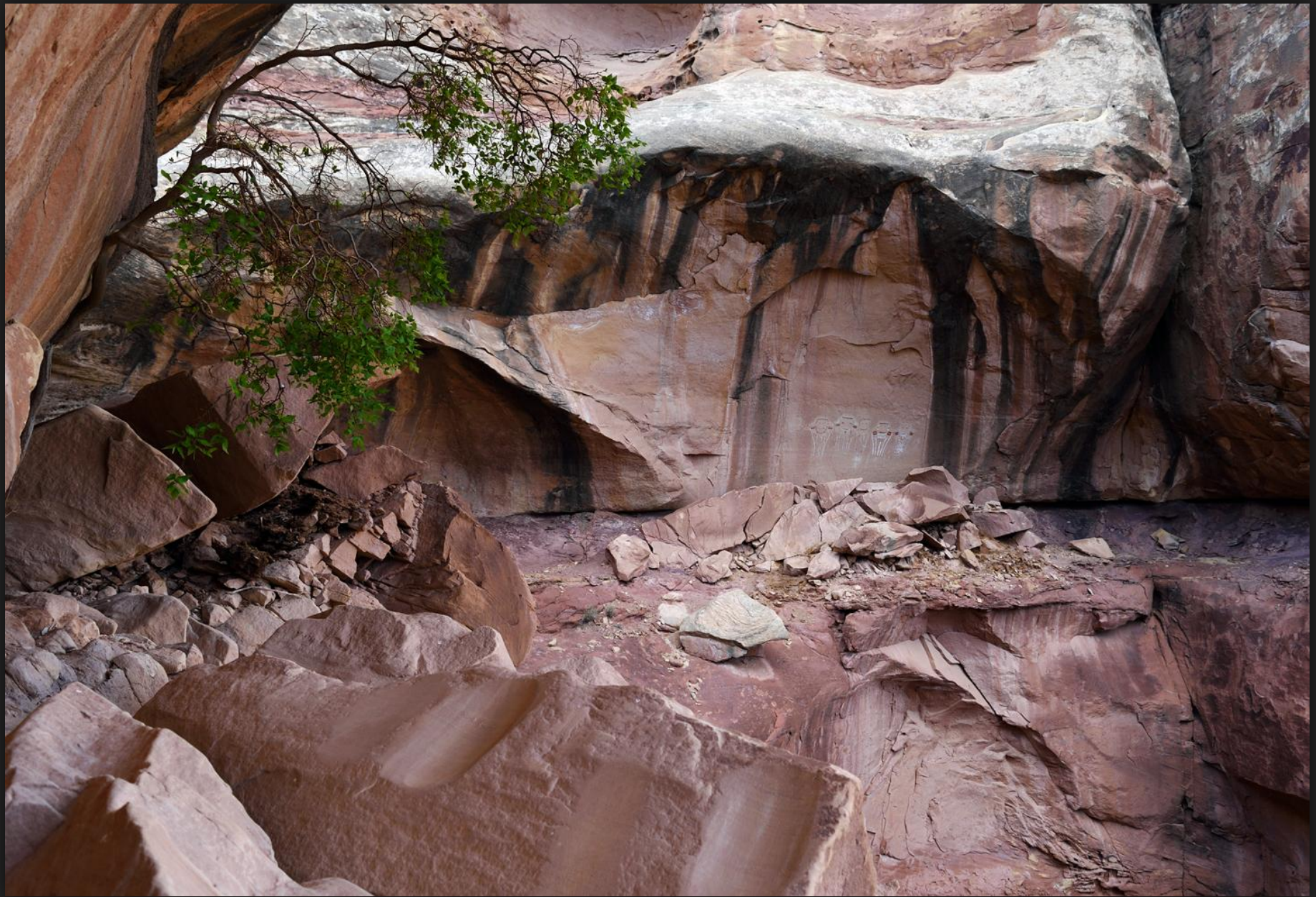
THE 5 FACES IN DAVIS CANYON – RUB STONES IN THE FOREGROUND