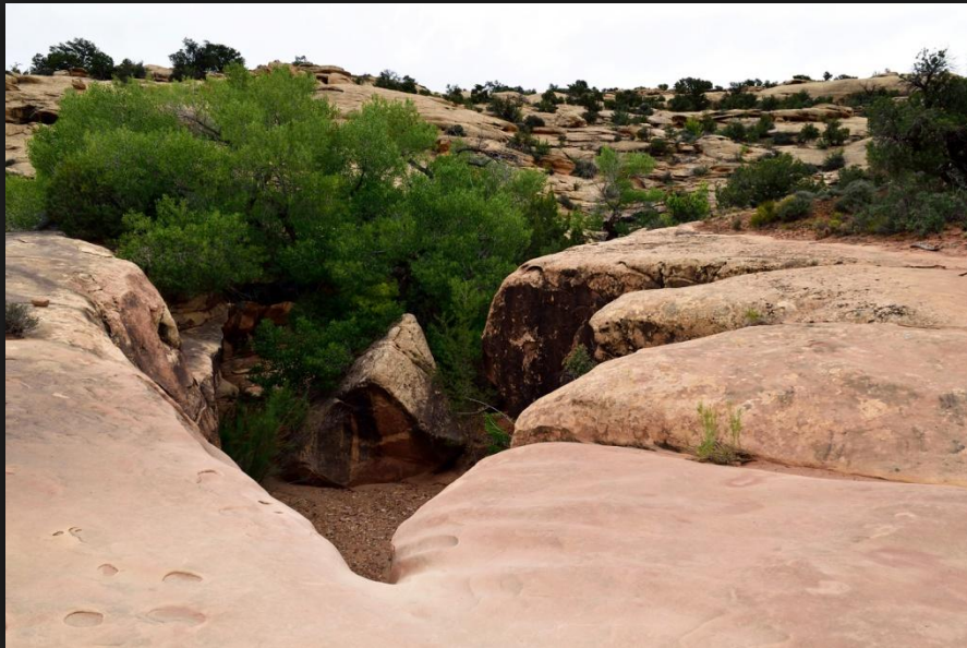
MOUTH OF THE CANYON – END OF SAND