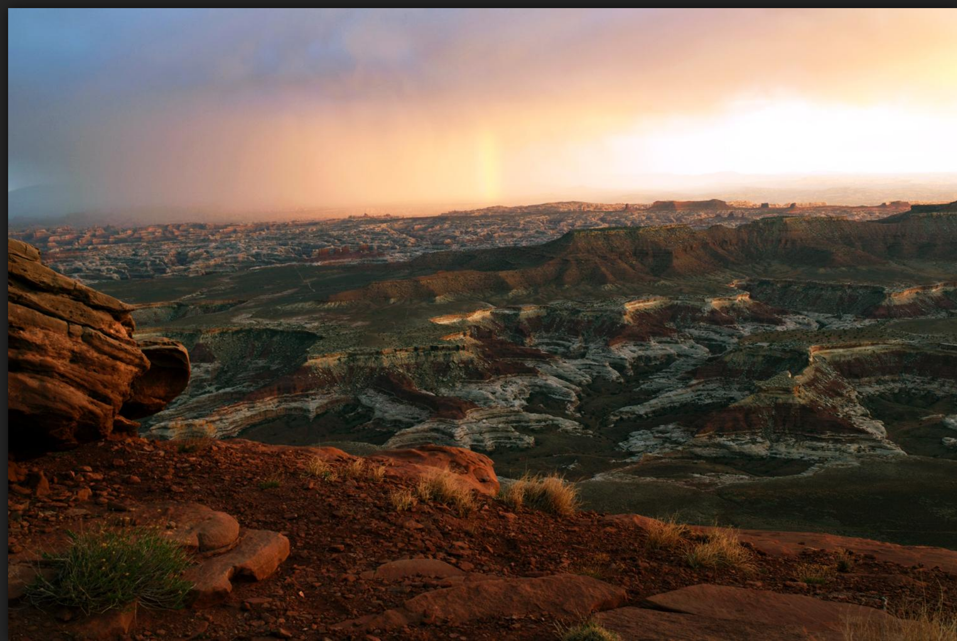
SUNSET & STORM – STANDING ROCKS BACKGROUND RIGHT – 5/8 19:10