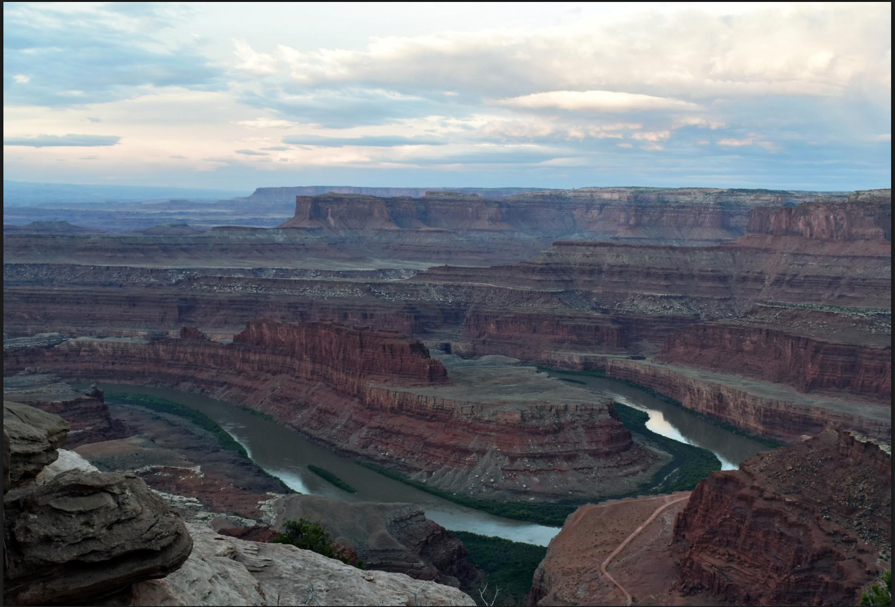
DEAD HORSE POINT