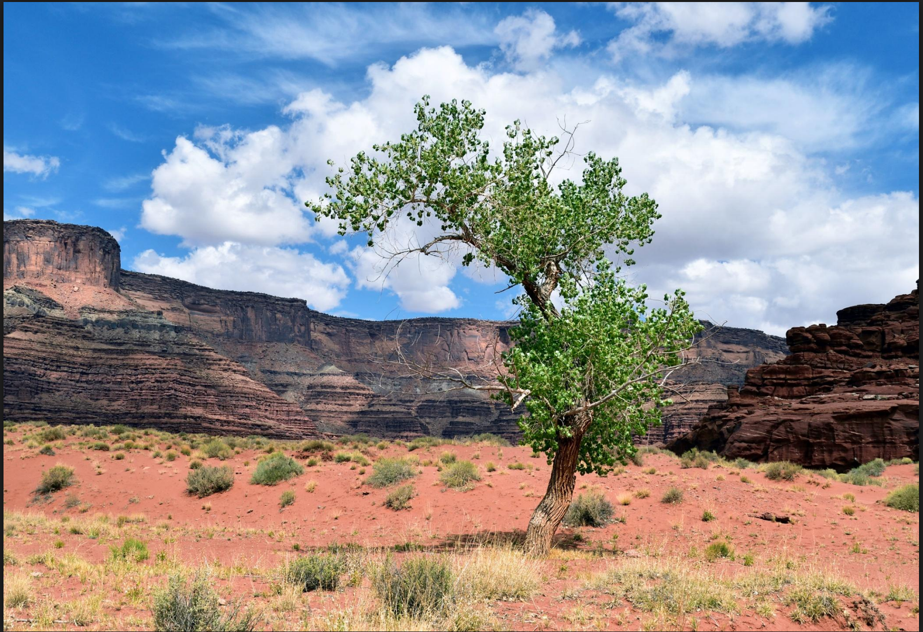
BENT TREE ON PATASH ROAD