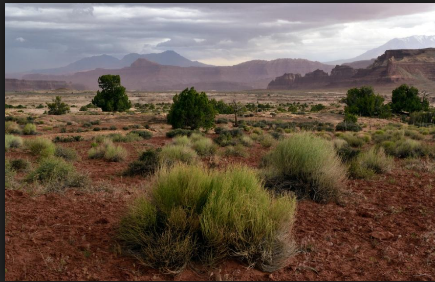
ENTERING GLEN CANYON AT HITE – ON OUR WAY TO THE MAZE