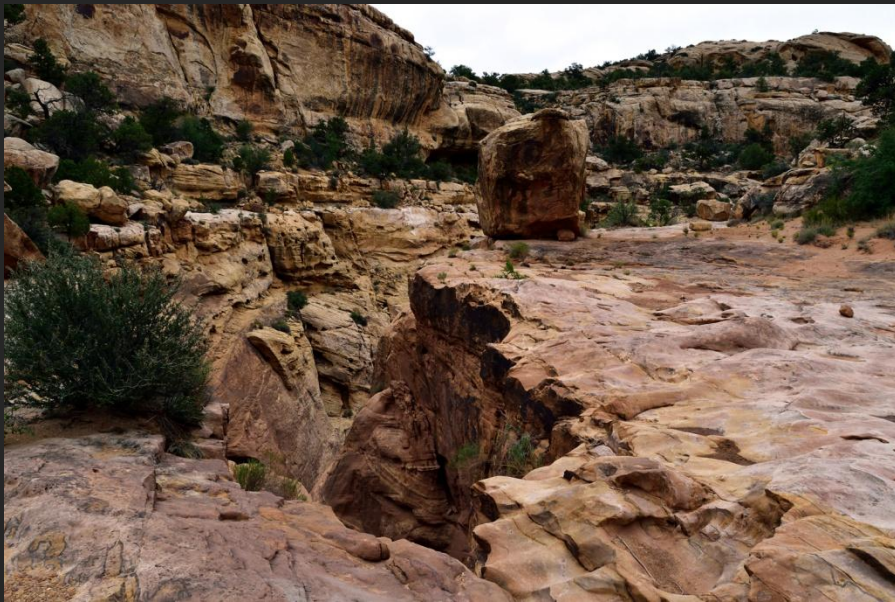
THE BIG DROP