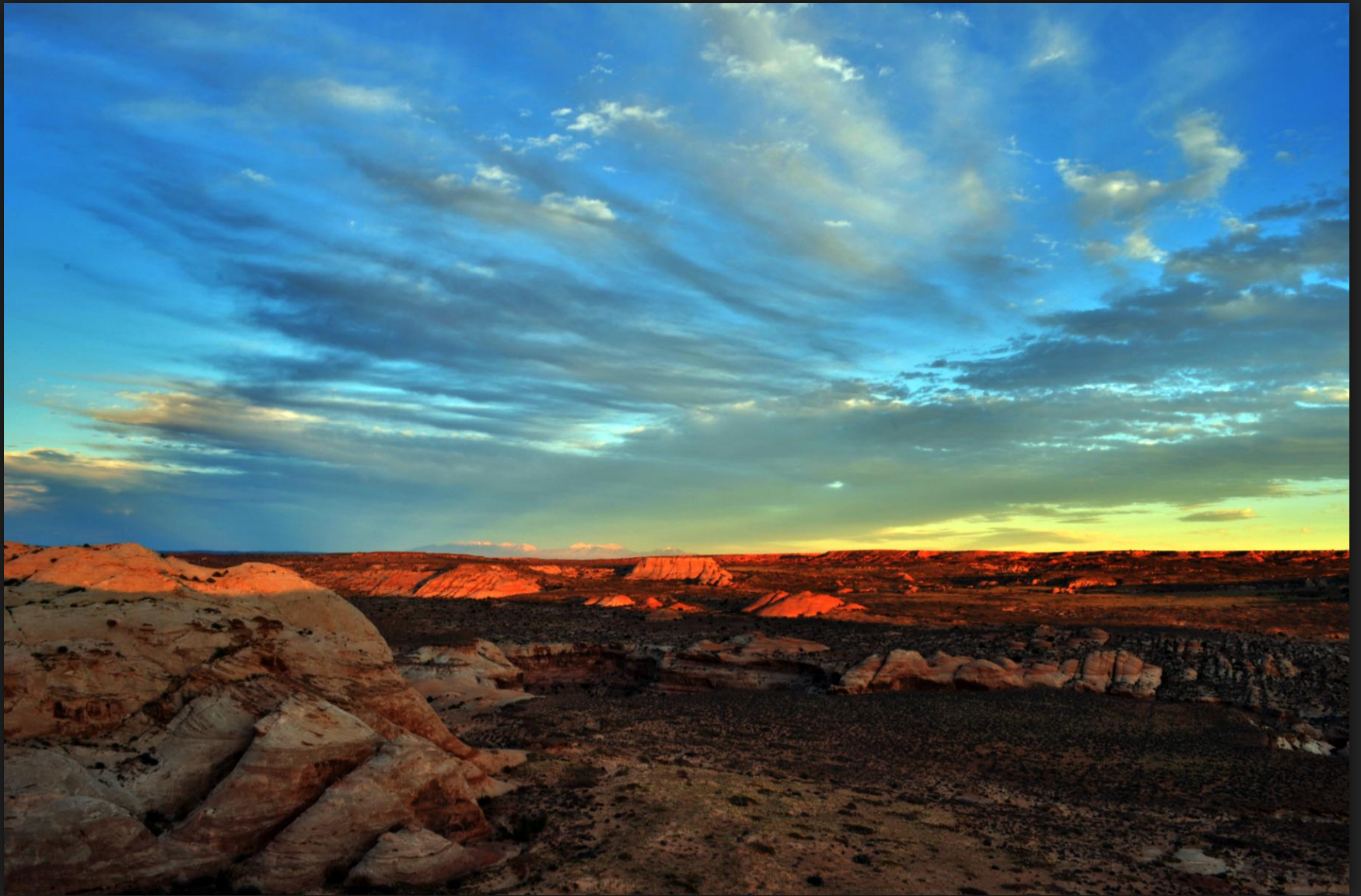
SUNSET AT THE HORSESHOE CANYON TRAILHEAD – 10/17/2011 AT 8:27 PM LOOKING EAST