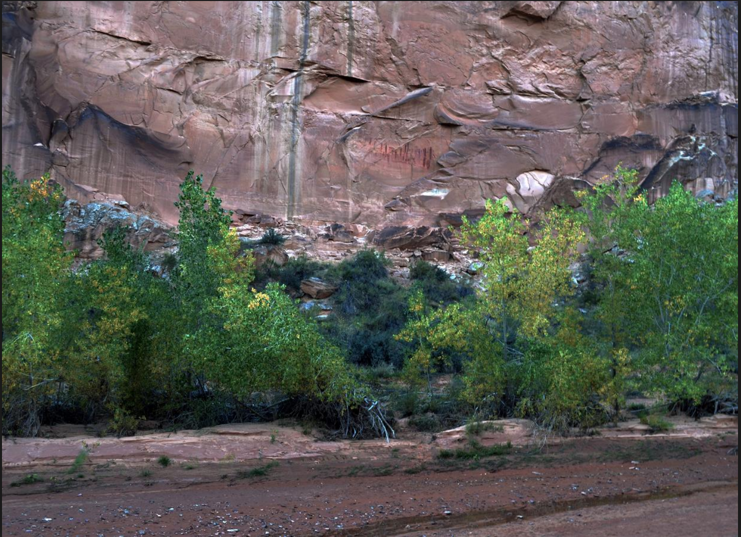
The High Gallery