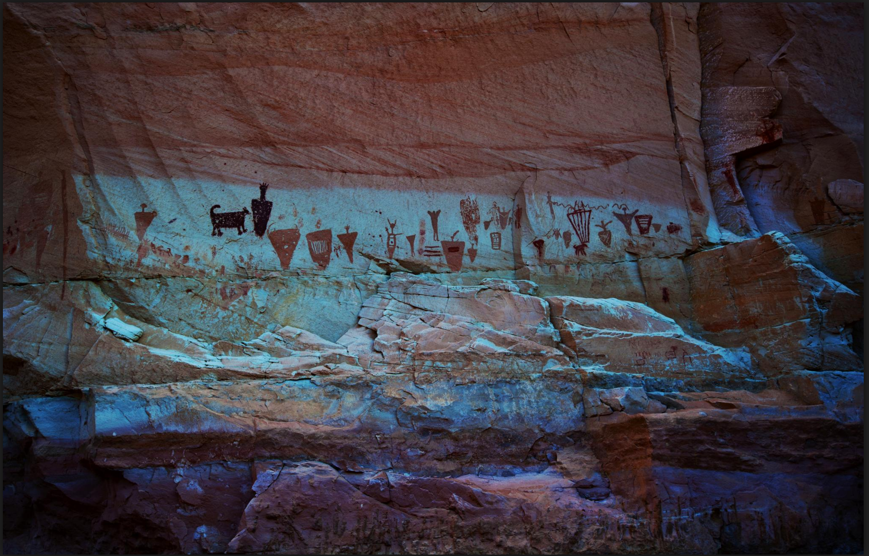
The Alcove Gallery