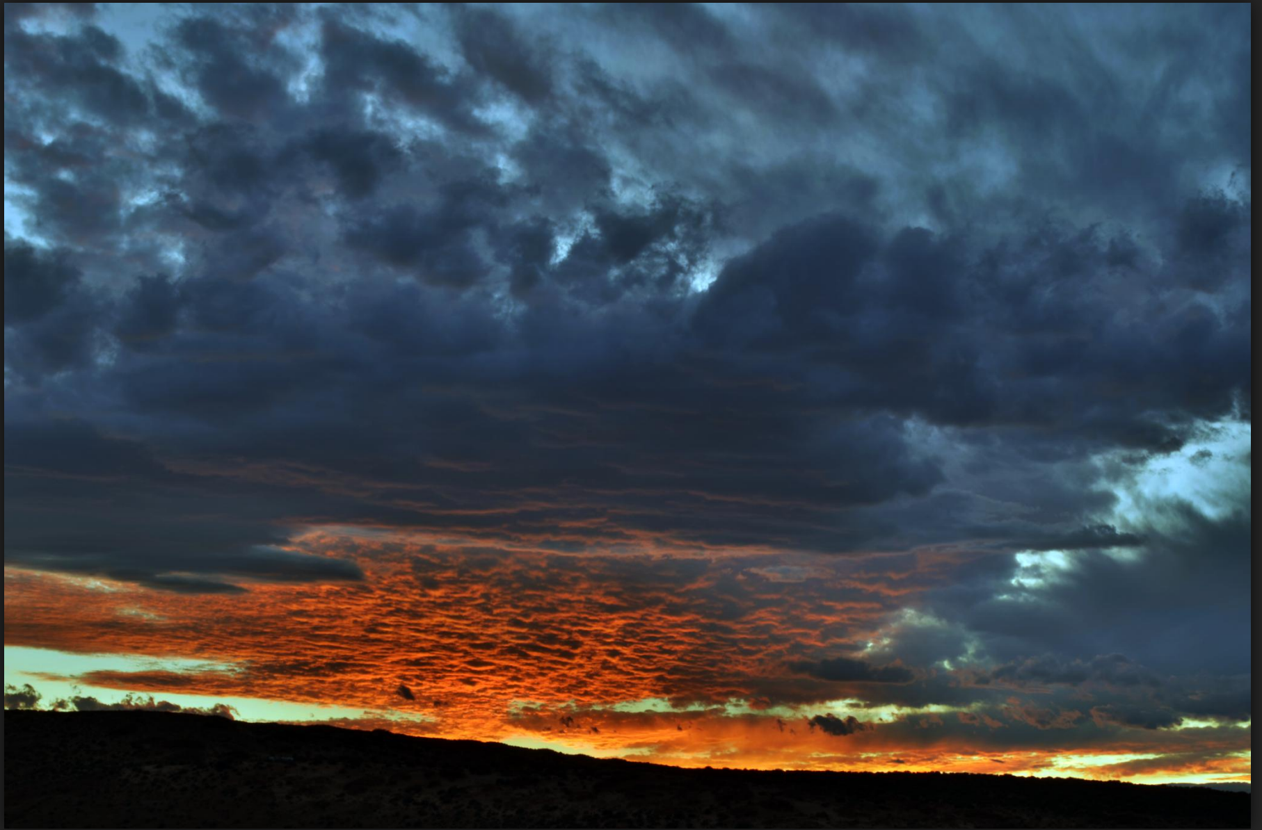
SUNSET AT THE HORSESHOE CANYON TRAILHEAD – 10/17/2011 AT 8:50 PM LOOKING WEST