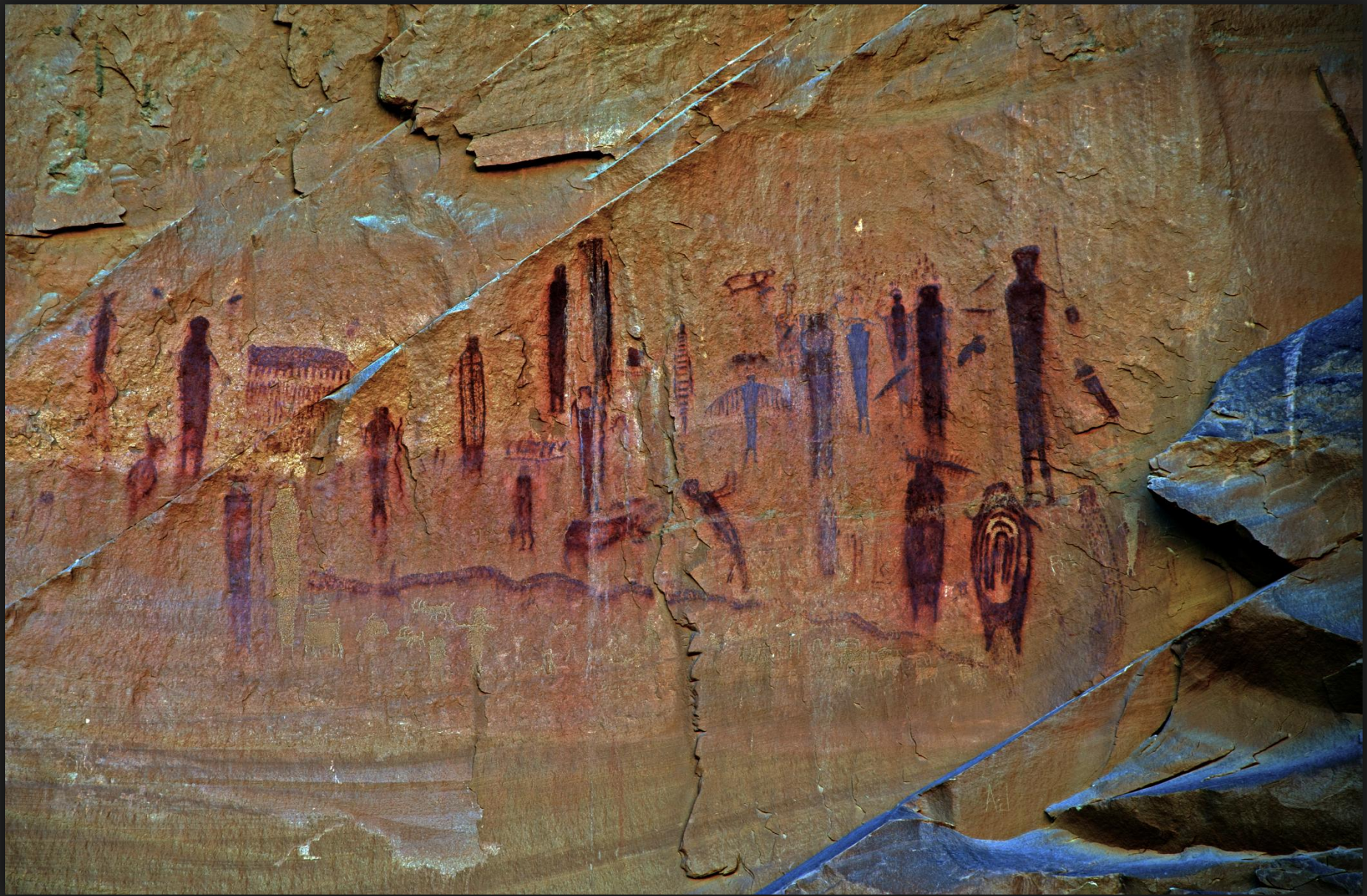
The High Gallery