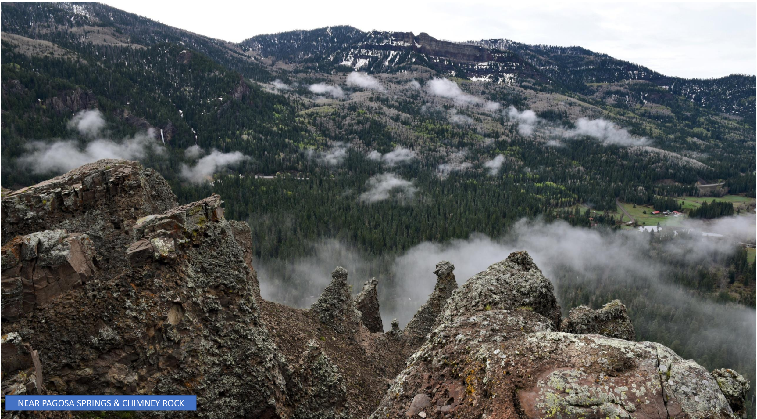
NEAR PAGOSA SPRINGS & CHIMNEY ROCK