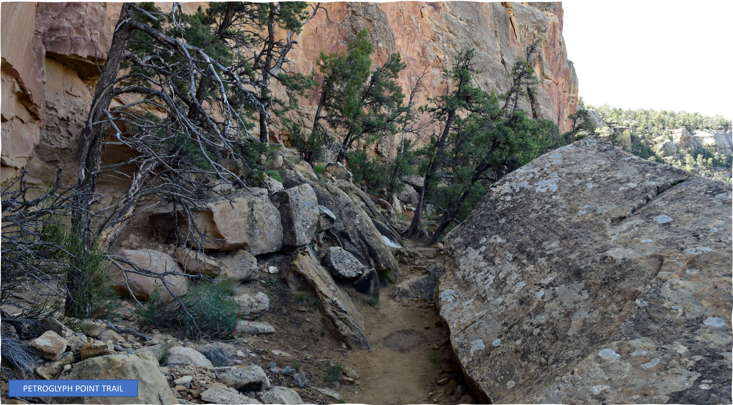
PETROGLYPH POINT TRAIL