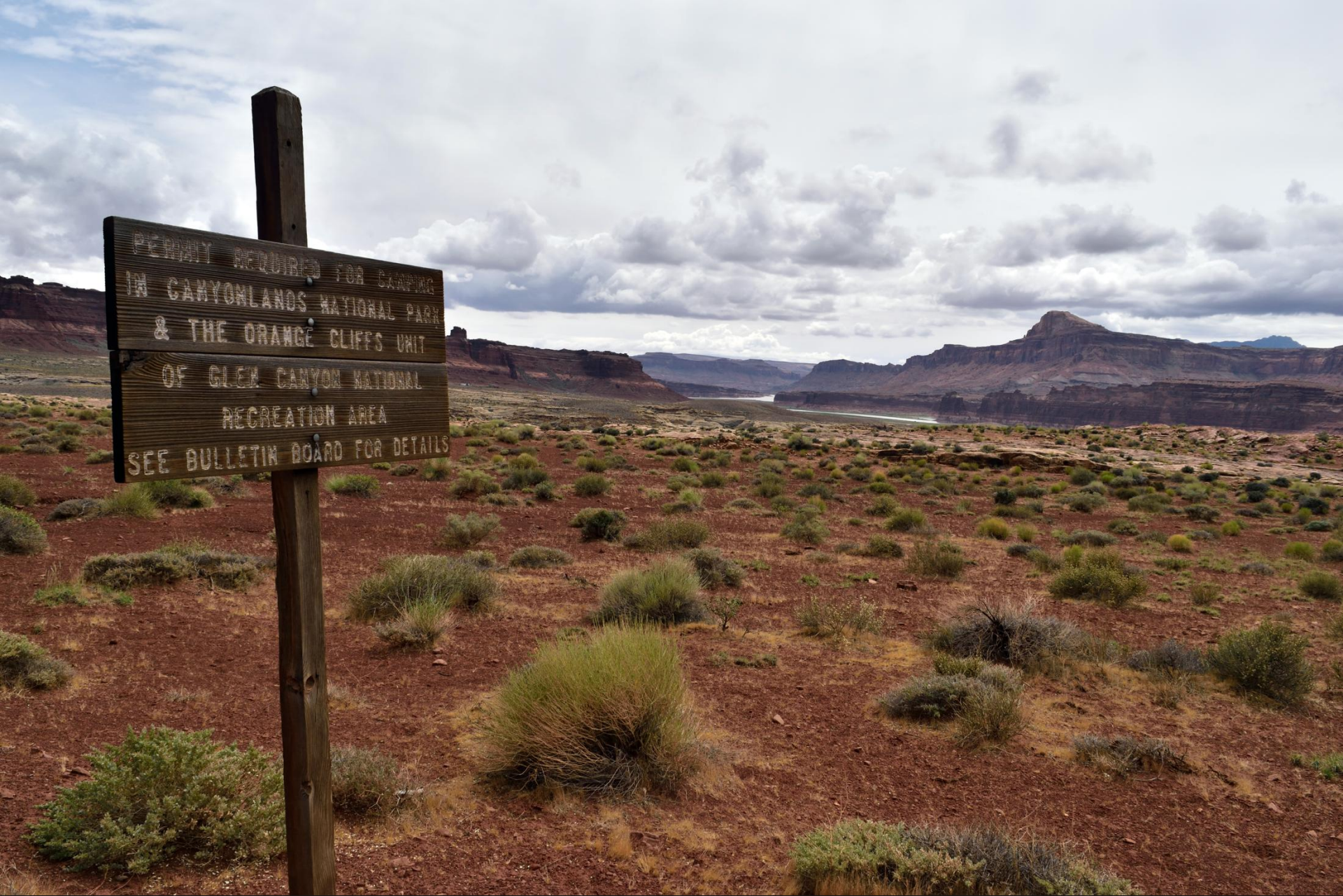
Exiting Glenn Canyon May 10, 2017 at 11:40