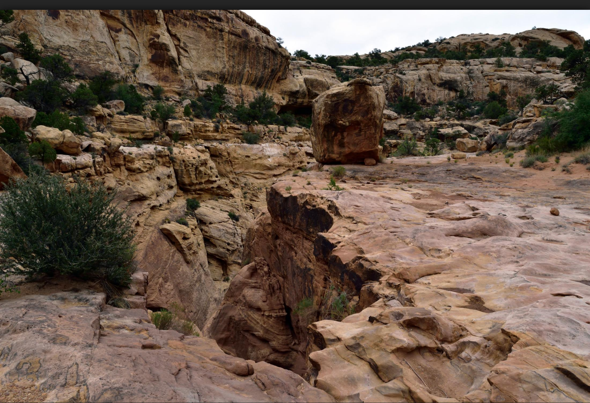
Repel Point #1