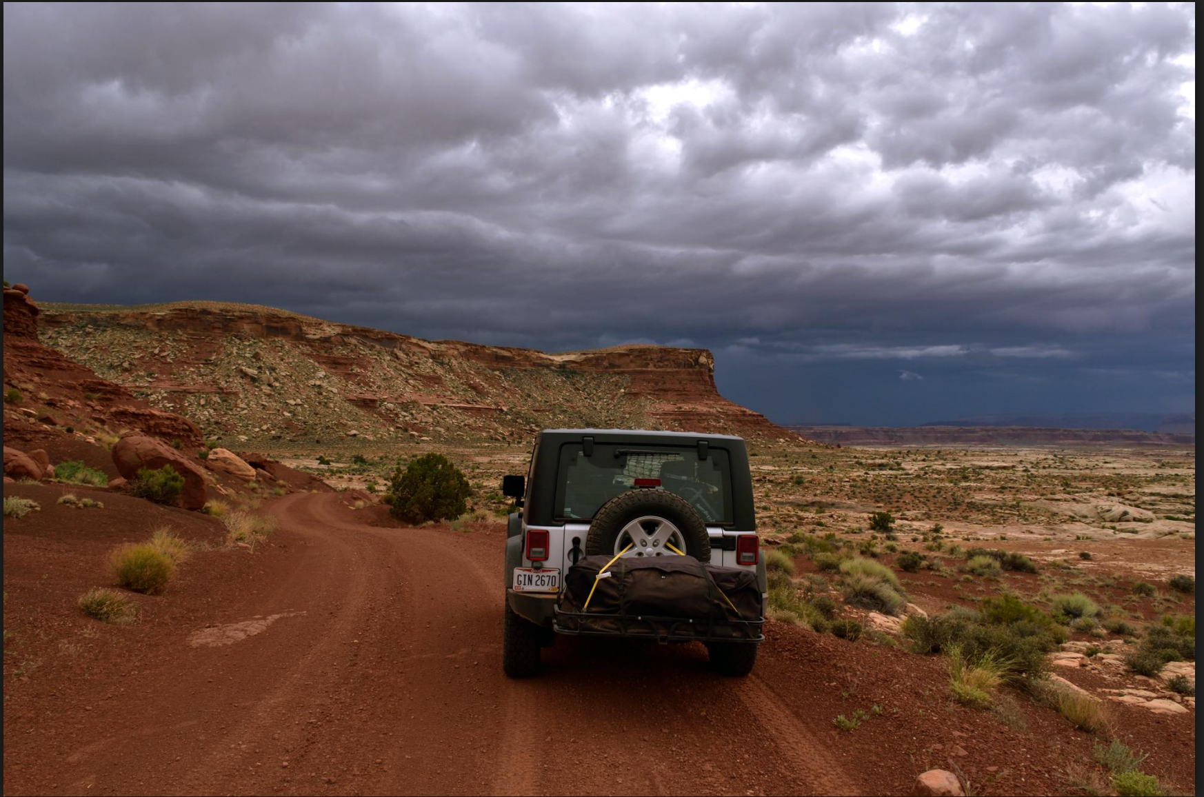
Heading into Glenn Canyon at Hite May 9, 2017 at 12:40