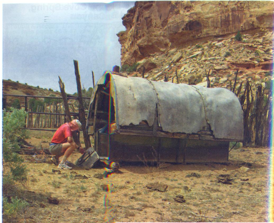
The old sheep camp (or wagon), on wheels, which is parked next to the corral in the middle part of Cove Canyon . These rigs were big enough to sleep 2 people, plus they were equipped with a dining table, cupboards and stove. Some newer models have solar panels and a small B+W TV.

From the Michael R. Kelsey book Hiking, Biking and Exploring Canyonlands National Park and Vicinity