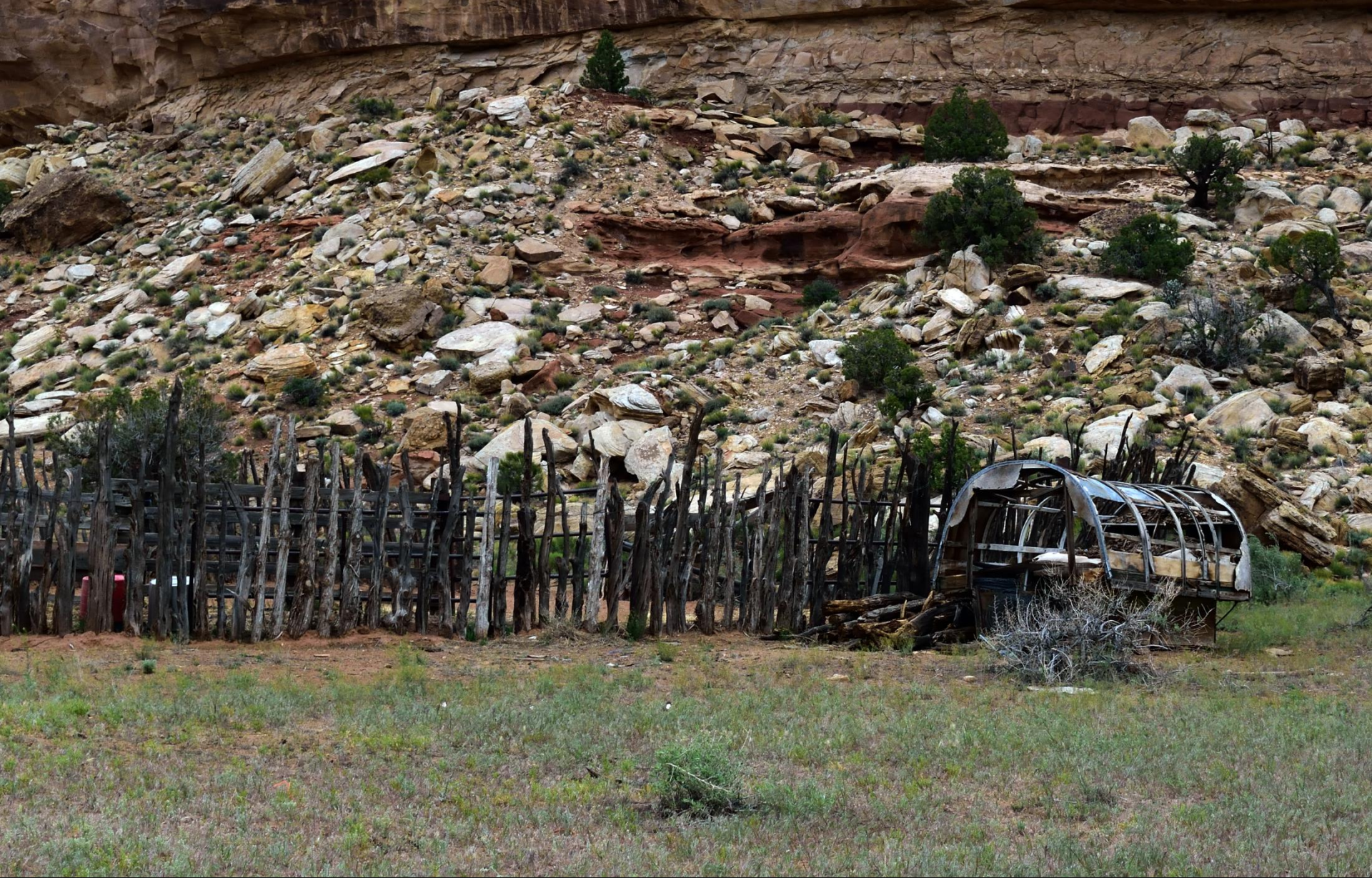
The Old Sheep Camp in Cove Canyon