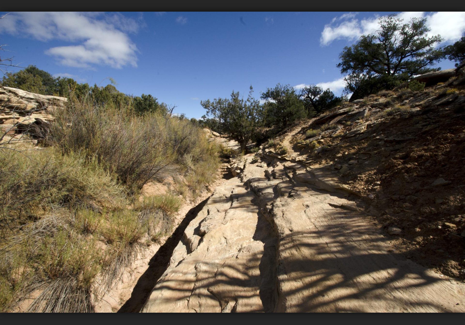
Heading out of the canyon at 10:30