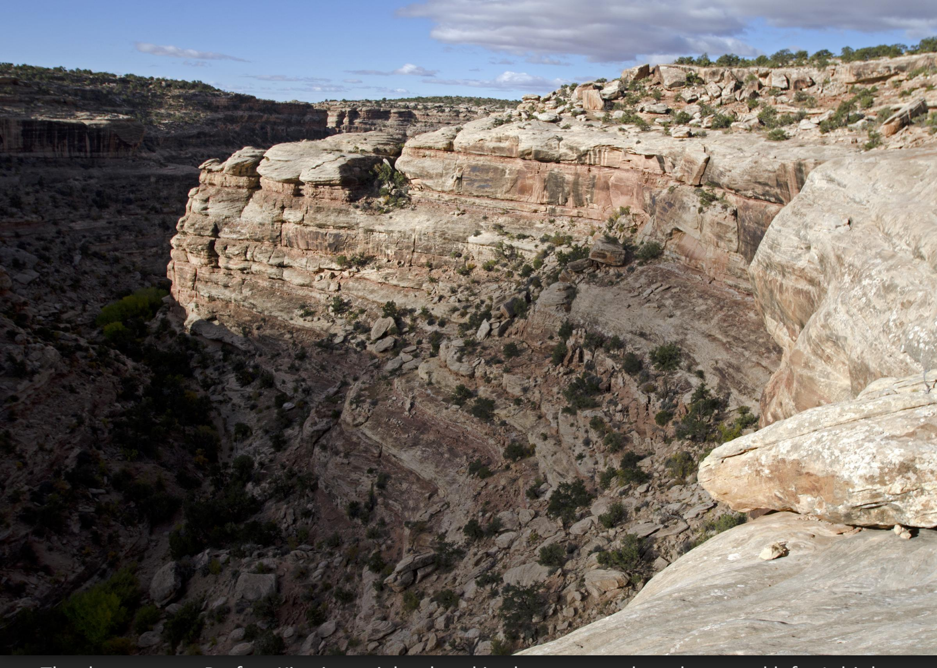
The drop spot to Perfect Kiva is straight ahead in that cutout, then down and left. I think.