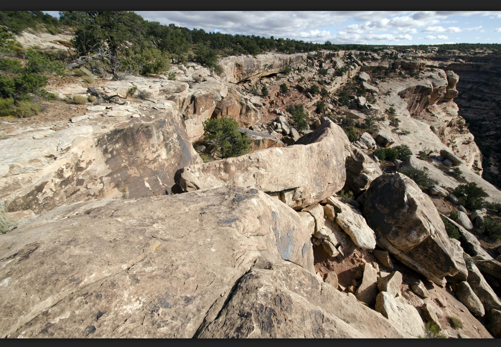
Heading back – out at this point and about a mile around the rim