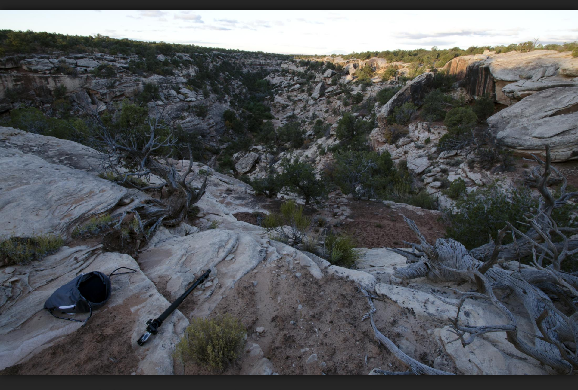
Slickhorn Canyon Rim Hike – Cedar Mesa – October 9 2017, 7:00