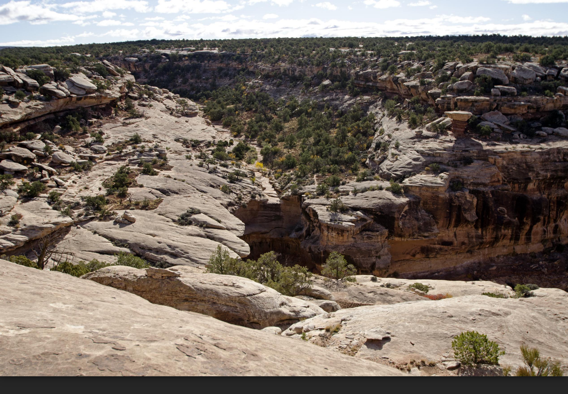
The in canyon route is through that center, then left at the dryfall to Perfect Kiva