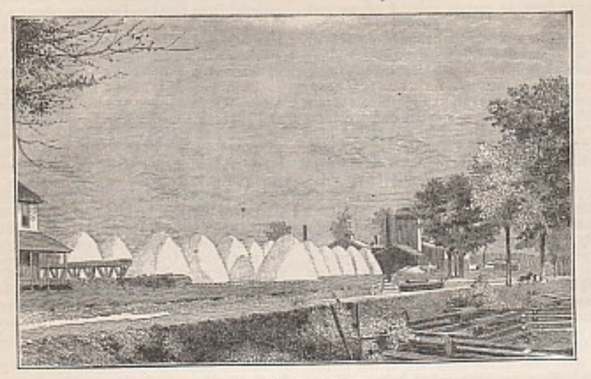
D. C. Winters, Photo., Paulding.