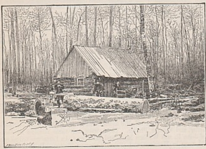
Postding, 1887.

The white beehive-shaped structures are the kilns for the burning of the charcoal,