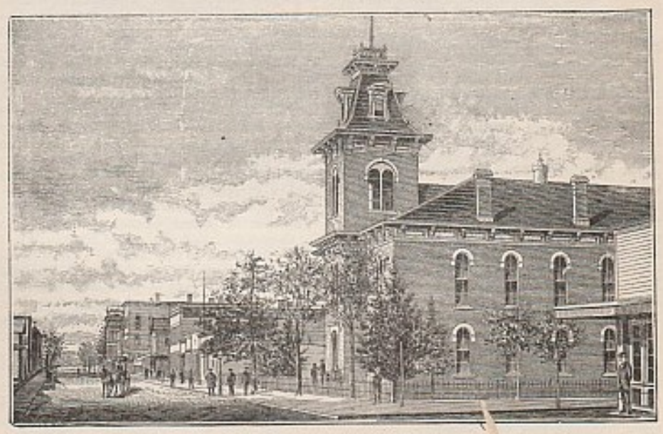
Ottown, 1887.